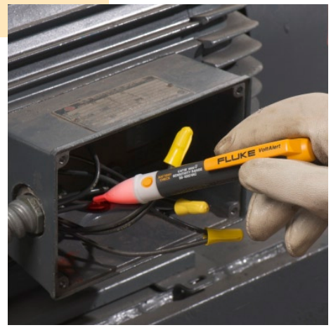
Electrical panel Junction box